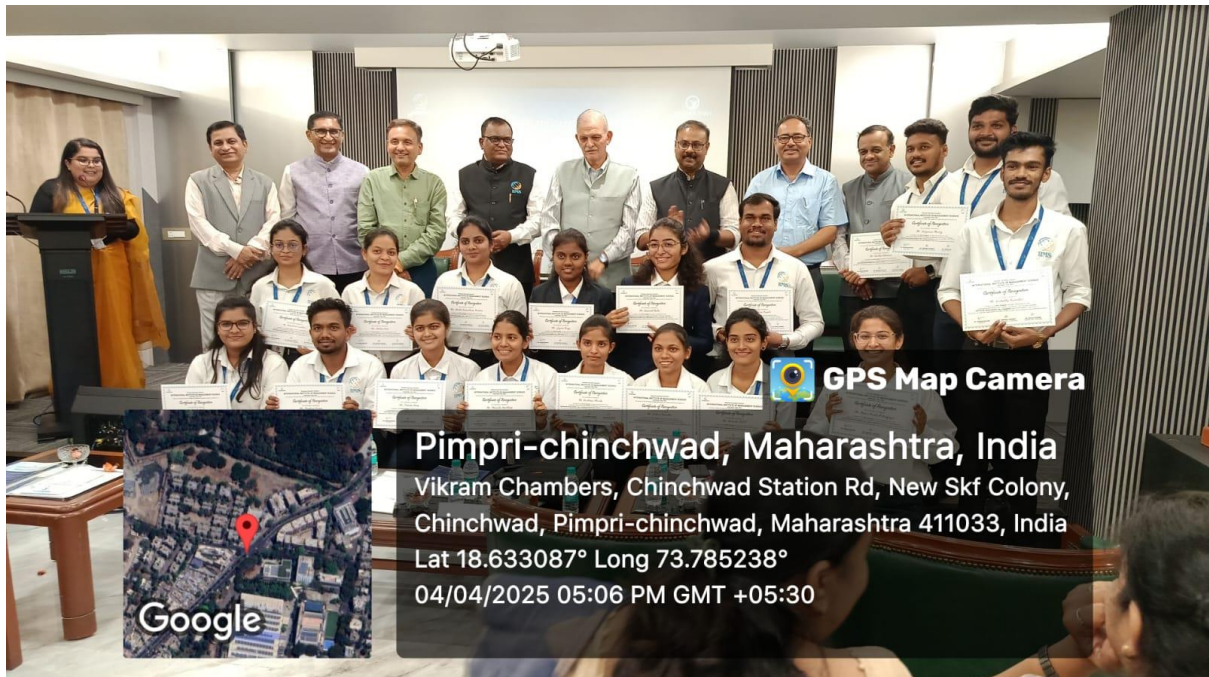
Academic Felicitation – Software Development Cell

Campus. : IIMS Bldg, S. No. 169/1/A, Opp. Elpro International, Chinchwad, Pune - 411033, Ph.: (020) 27353730/32/33/34, Fax : (020) 27354731 Website. : www.iims.ac.in E-mail : info@iims.ac.in