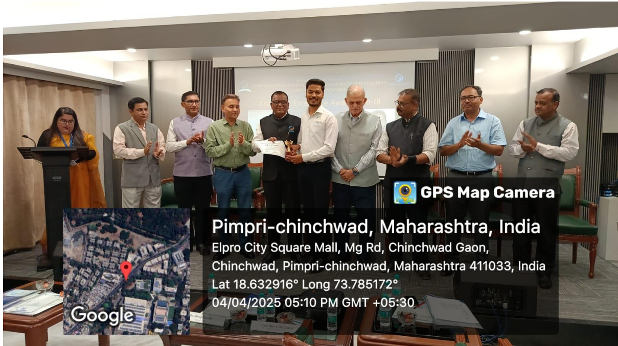
Academic Felicitation – Award for Academic Excellence – Sem III

Campus. : IIMS Bldg, S. No. 169/1/A, Opp. Elpro International, Chinchwad, Pune - 411033, Ph.: (020) 27353730/32/33/34, Fax : (020) 27354731 Website. : www.iims.ac.in E-mail : info@iims.ac.in