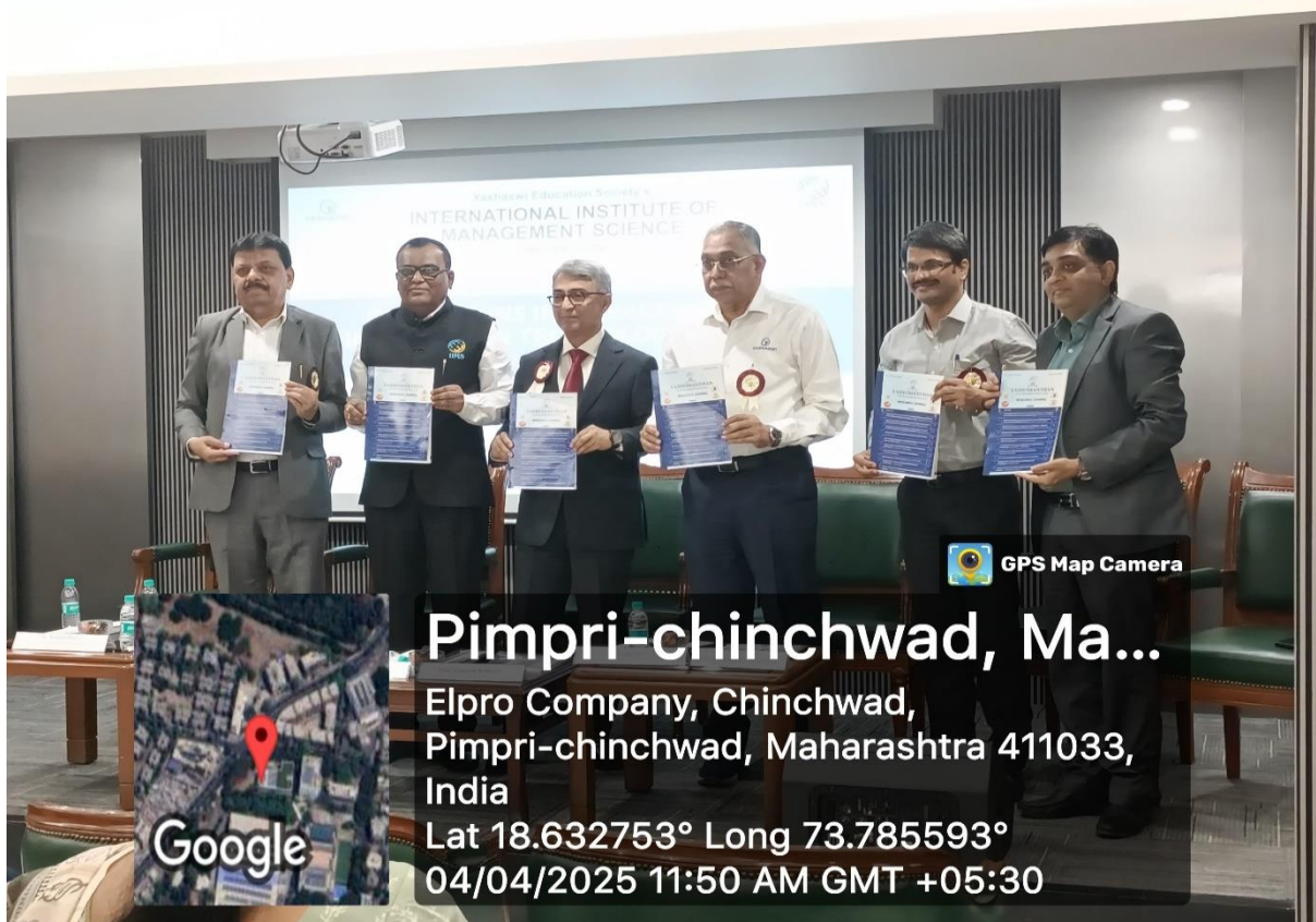
Release of Yashomanthan