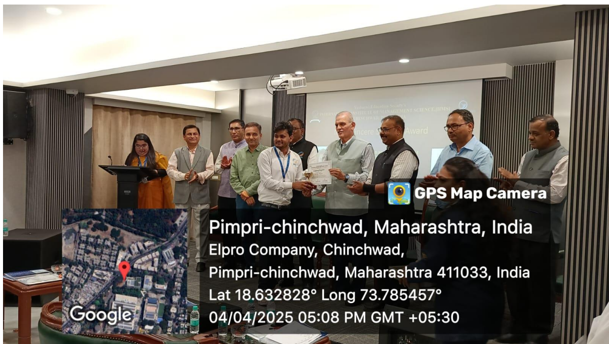
Academic Felicitation – Award for Most Sincere Student