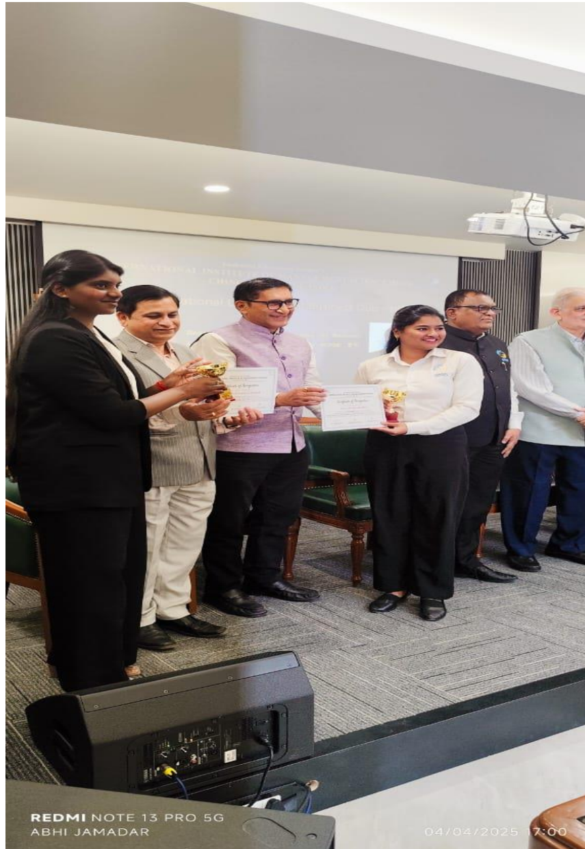
Academic Felicitation – Award for National Level Achievement

Campus. : IIMS Bldg, S. No. 169/1/A, Opp. Elpro International, Chinchwad, Pune - 411033, Ph.: (020) 27353730/32/33/34, Fax : (020) 27354731 Website. : www.iims.ac.in E-mail : info@iims.ac.in