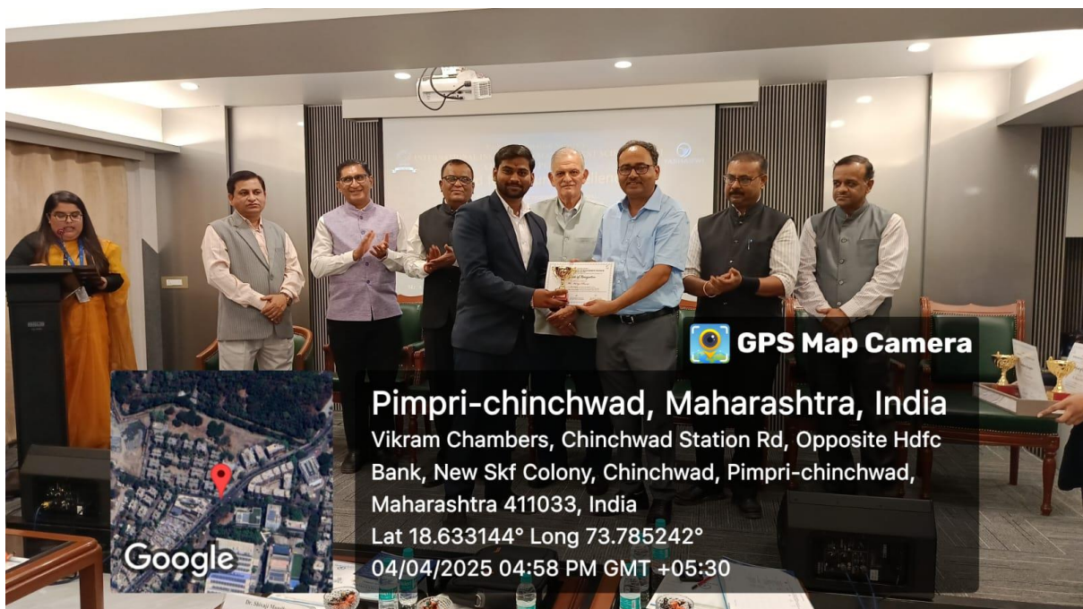
Academic Felicitation – Award for Cultural Excellence