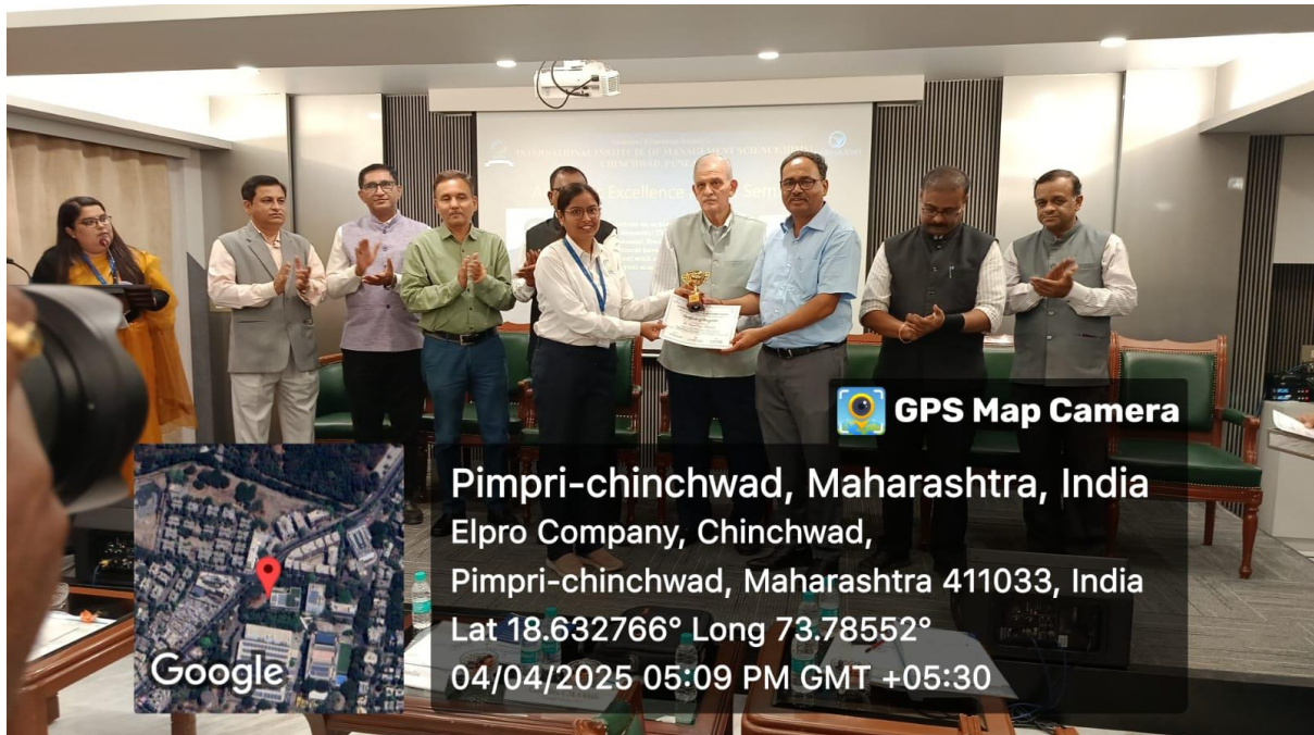
Academic Felicitation – Award for Academic Excellence – Sem I