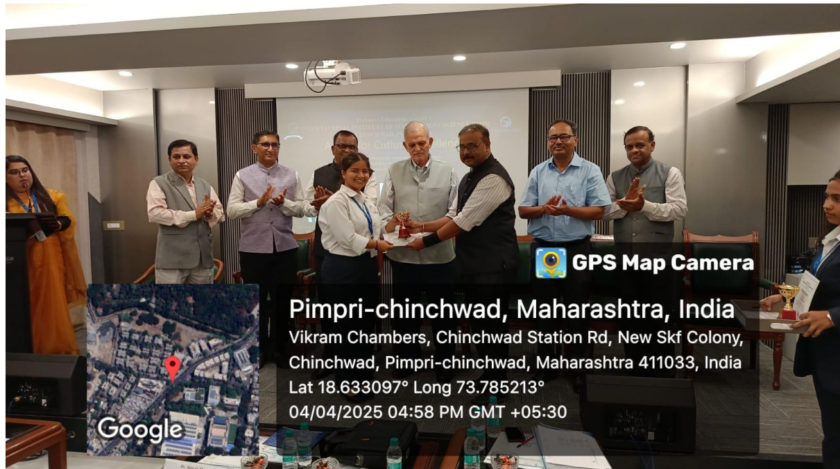
Academic Felicitation – Award for Cultural Excellence

Campus. : IIMS Bldg, S. No. 169/1/A, Opp. Elpro International, Chinchwad, Pune - 411033, Ph.: (020) 27353730/32/33/34, Fax : (020) 27354731 Website. : www.iims.ac.in E-mail : info@iims.ac.in