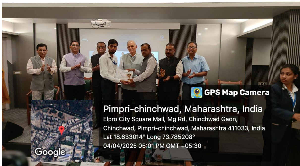
Academic Felicitation – Award for Best SIP Marketing