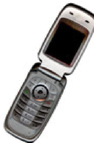
Fig. 2 Example of an unacceptable low-resolution image

must be placed after their associated figures, as shown in Fig. 1.