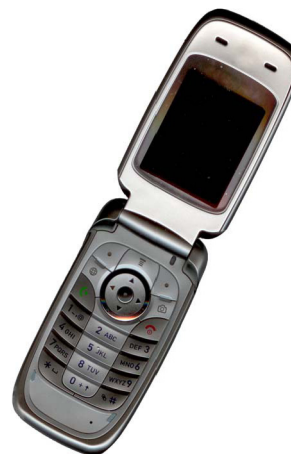
Fig. 3 Example of an image with acceptable resolution